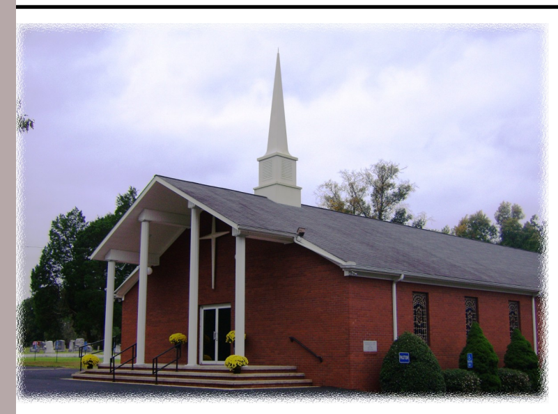
Cross Roads Missionary Baptist Church